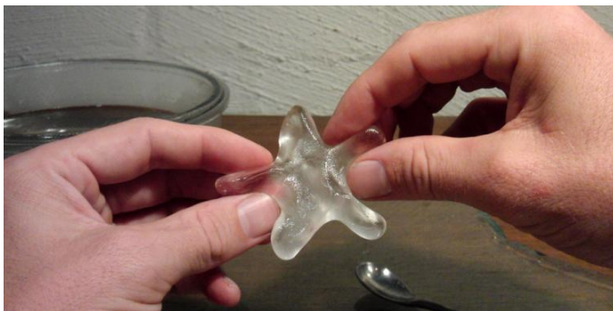
Shaping By Hand

If you're not satisfied with your creation, reheat it and try again!